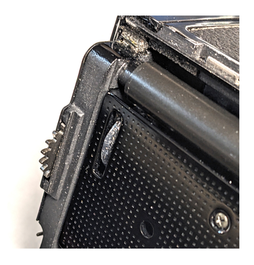
Congratulations! Your back can now accept 65mm film and all types of 70mm film!